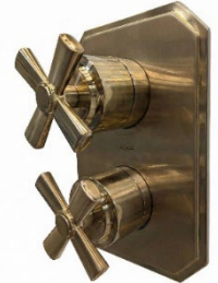
16PBP3.X.SF (non-sharing) 16PBP3S.X.SF (sharing)